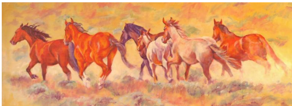
Wild Mustang Mares, 12x48", oil on masonite