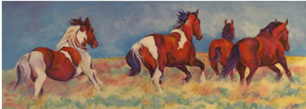
Wild Mustang Stallions Free Again, 18x48", oil on masonite, © Karen Brenner 2011

You will find details about the roundup and photos from my trip on my Wild Horse Roundup blog .